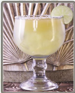
SHOWN IN MACHO SIZE