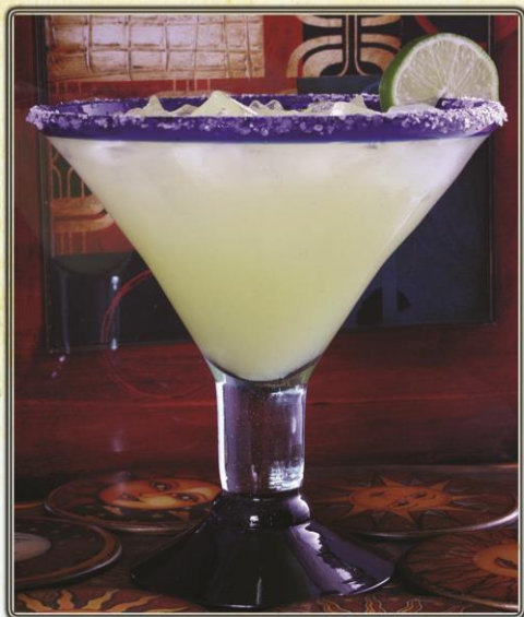
SHOWN IN SUPER MACHO SIZE

All Margaritas are available in Lime (original), Raspberry, Peach, Mango, Strawberry or Passion Fruit.