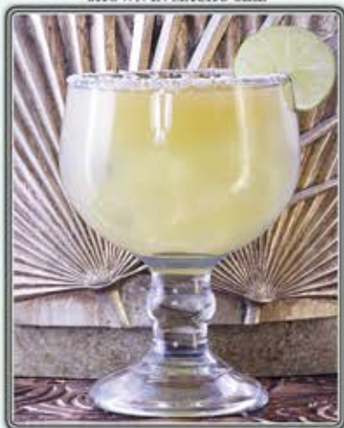
SHOWN IN MACHO SIZE