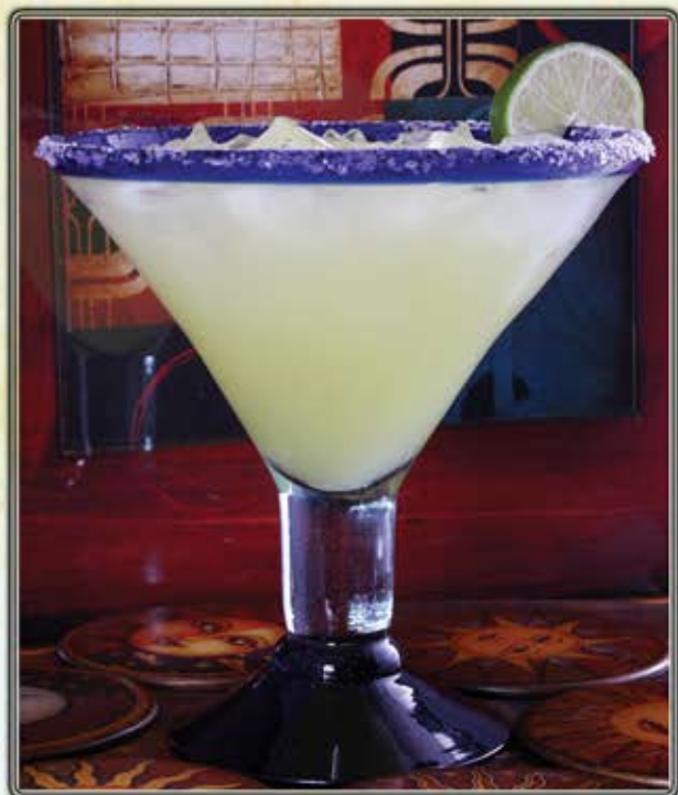
SHOWN IN SUPER MACHO SIZE

All Margaritas are available in Lime (original), Raspberry, Peach, Mango, Strawberry or Passion Fruit.